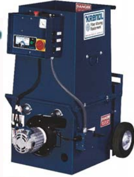
(Optional ELU Control System and Wheel Package)