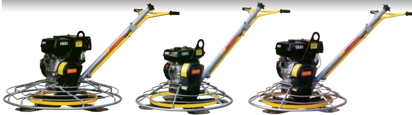
SCT46H110 46" Ring Diameter 9.5 HP Honda engine* Shown with Standard Handle